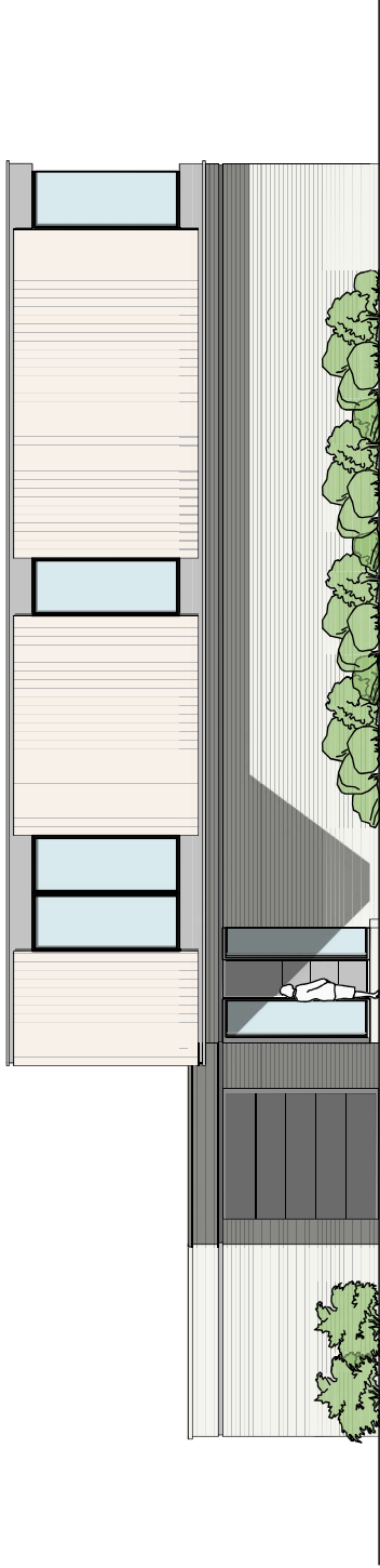
NORTH WEST ELEVATION SCALE 1:100 @ A3